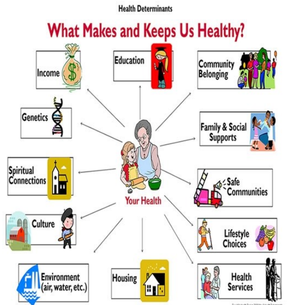
Diagram courtesy Five Hills Health Region